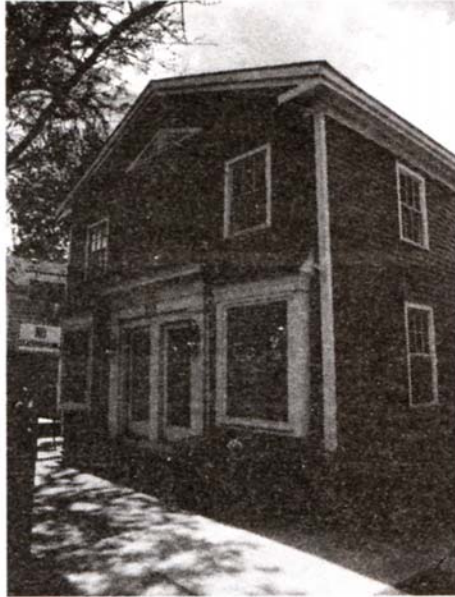
Main Street Cupcakes in Hudson, OH

travels to Italy influenced your cupcakes?